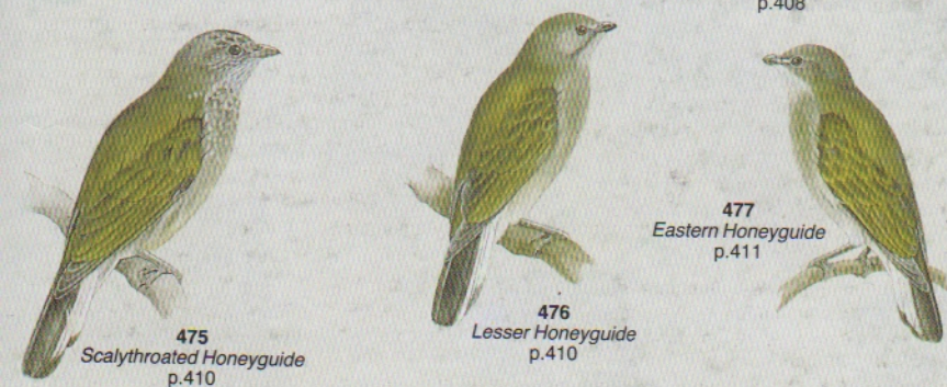
475 Scalythroated Honeyguide p.410