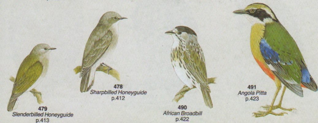
479 Slenderbilled Honeyguide p.413