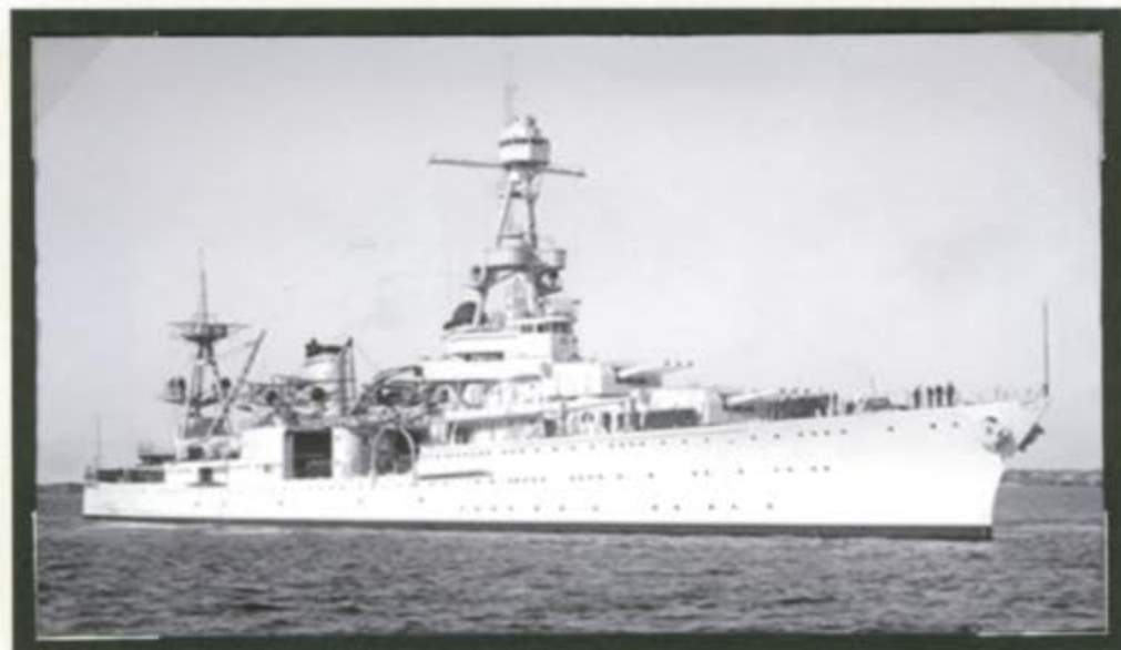
Circa 1938. Photo. The USS Louisville in the late 1930s on her South American "Show the Flag" tour.