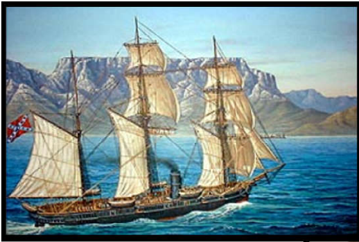
Commerce raiding in the seas around the Cape. August 1863.