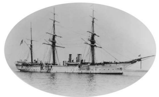
At left the back of the card; written on board the ship “Alexandine” (above) and dated by the writer as 12.04.1893. 2

Britain ceded the Heligoland islands to Germany in 1890 in the Heligoland–Zanzibar Treaty, which explains the exclamation mark on the address after Germany!