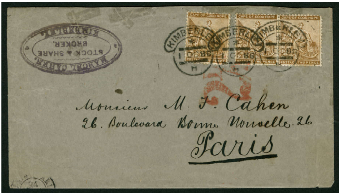
Cover. 1888. KIMBERLEY '1 OC 88' to PARIS, FRANCE. NOTE: Same date as stamp above! See overleaf for description.

1 OC 88 ('88' inverted?) TOP: Asterisk - Vertical BETWEEN BARS: DAY MONTH YEAR BOTTOM: Time Code Letter H USED: On dispatch