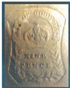
Computer enhanced photocopy